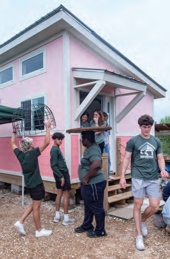
Kingwood Park High School students work on a tiny home.