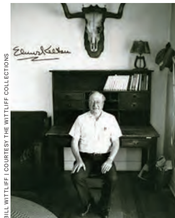
BILL WITTLIFF | COURTESY THE WITTLIFF COLLECTIONS